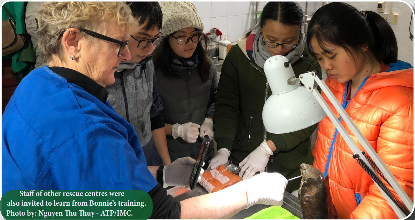
Staff of other rescue centres were also invited to learn from Bonnie's training.

For more current news and updates on tortoise and freshwater turtle conservation in Asia, visit our website: www.asianturtleprogram.org