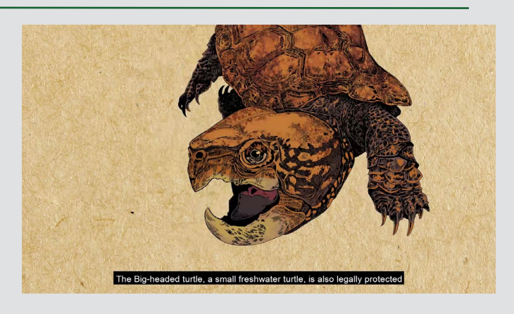
This video includes beautiful art by Jeet Zdung, depicting the unique Big-headed Turtle ( Platysternon megacephalum ).